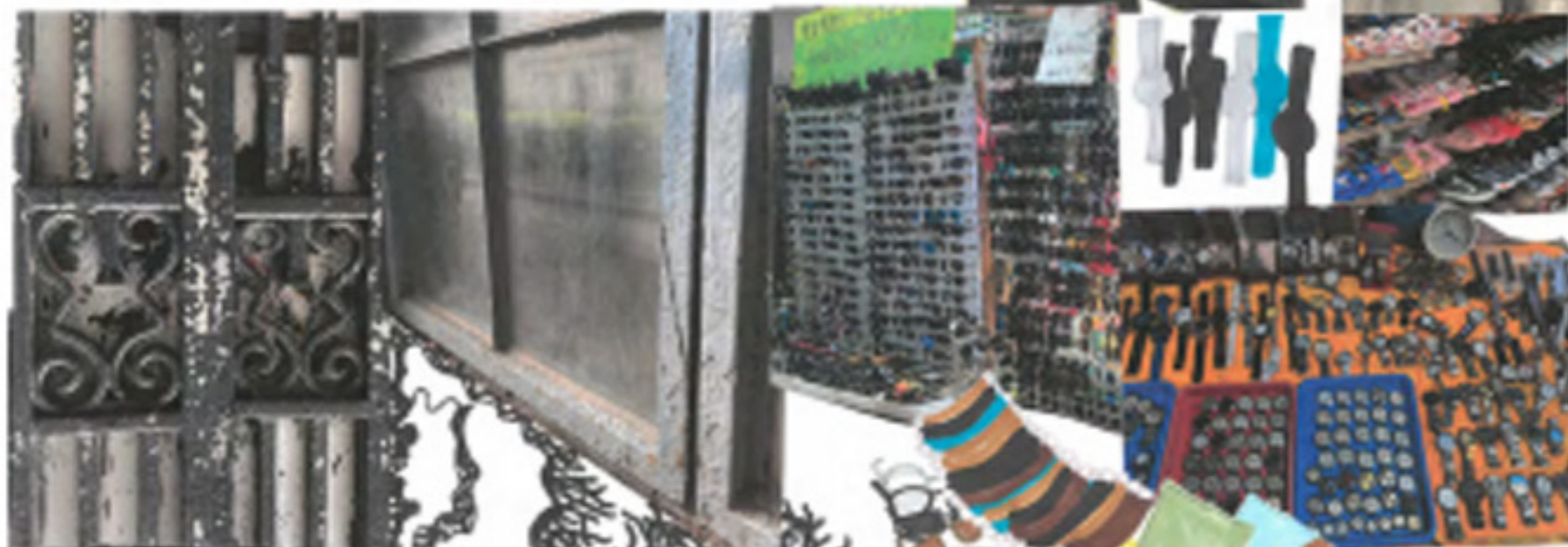
PEELS OFF DETAILS