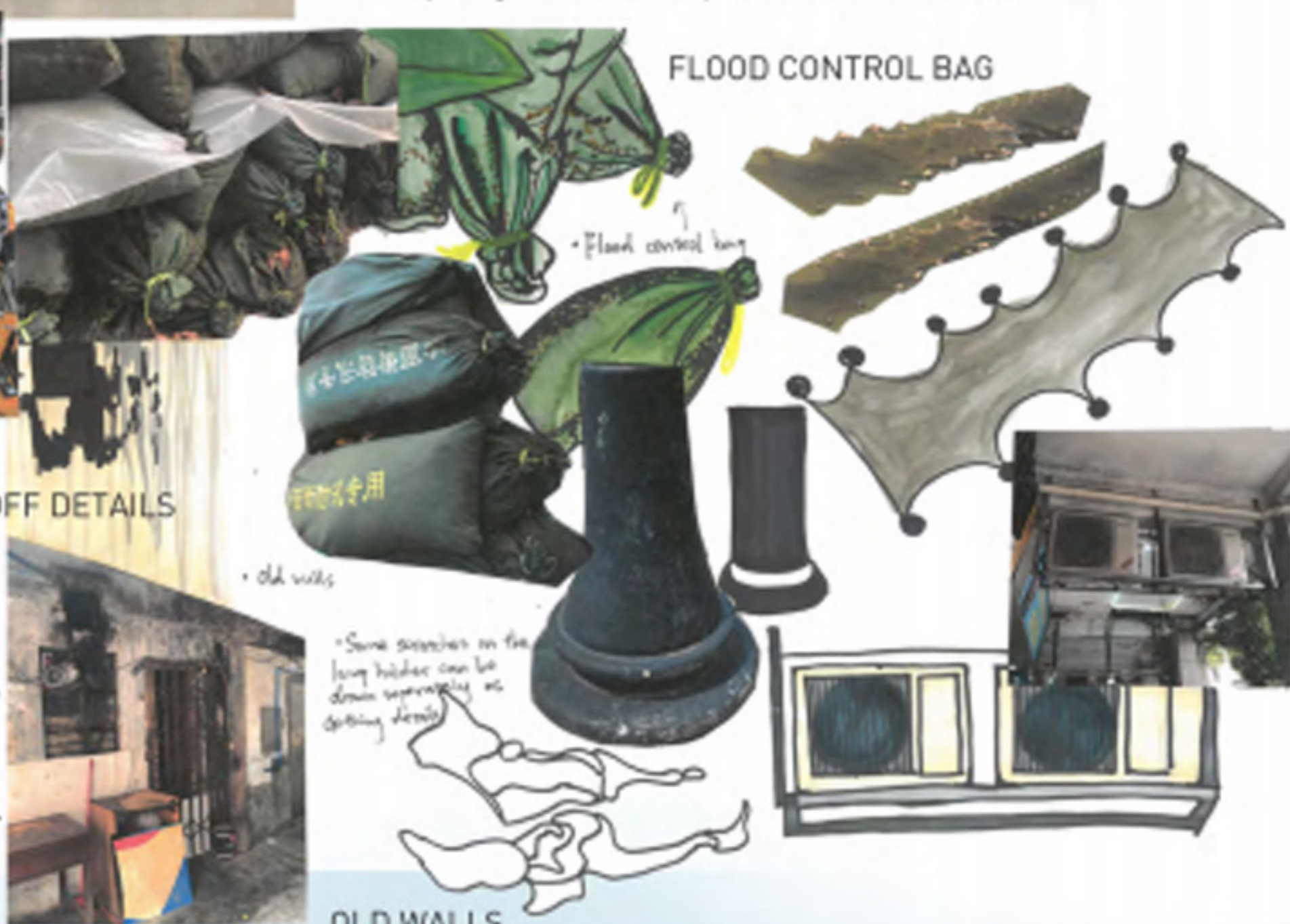
FLOOD CONTROL BAG