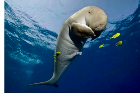
This is the true mermaid.