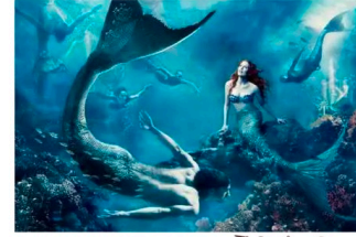
This is from human's image

Legend mermaid is bound by the waist, most of the upper body is a beautiful woman, the lower body is covered with scales of beautiful fish tail, the whole body, both attractive, and easy to escape quickly. Male and female, soulless and as heartless as the sea; Voices are often as deceptive as they look; A combination of temptation, vanity, beauty, cruelty and despair of love and other characteristics. It can live underwater, it can live on dry land for a short time, and because of modern imagination, it can be amphibious and even have magical powers.