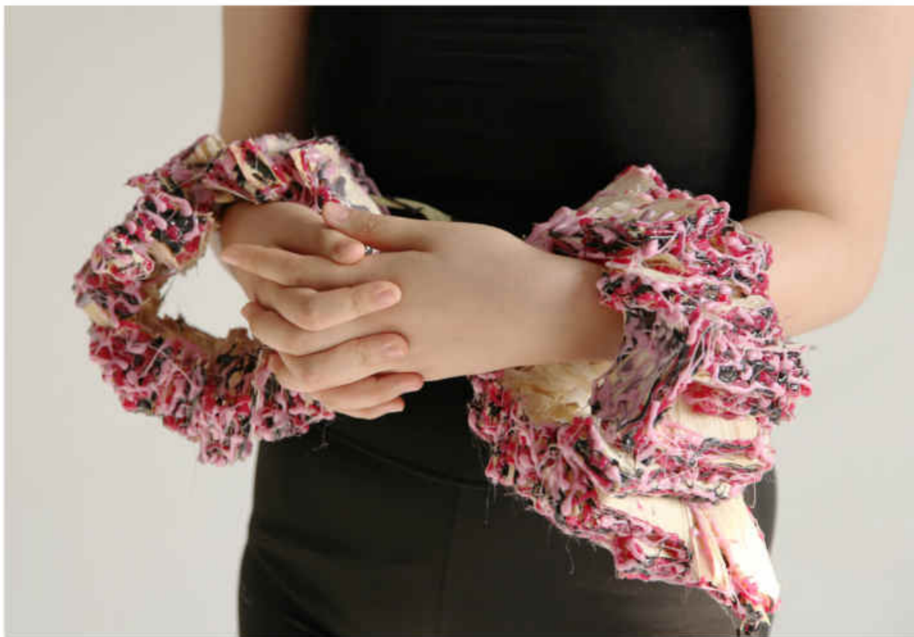
Handcuffs / coloured glue stick / 15*30