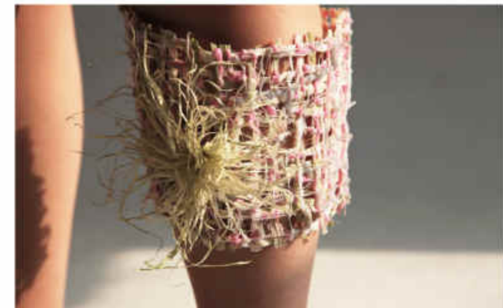
Leg decoration / corn leaves / coloured glue stick / 30*20cm