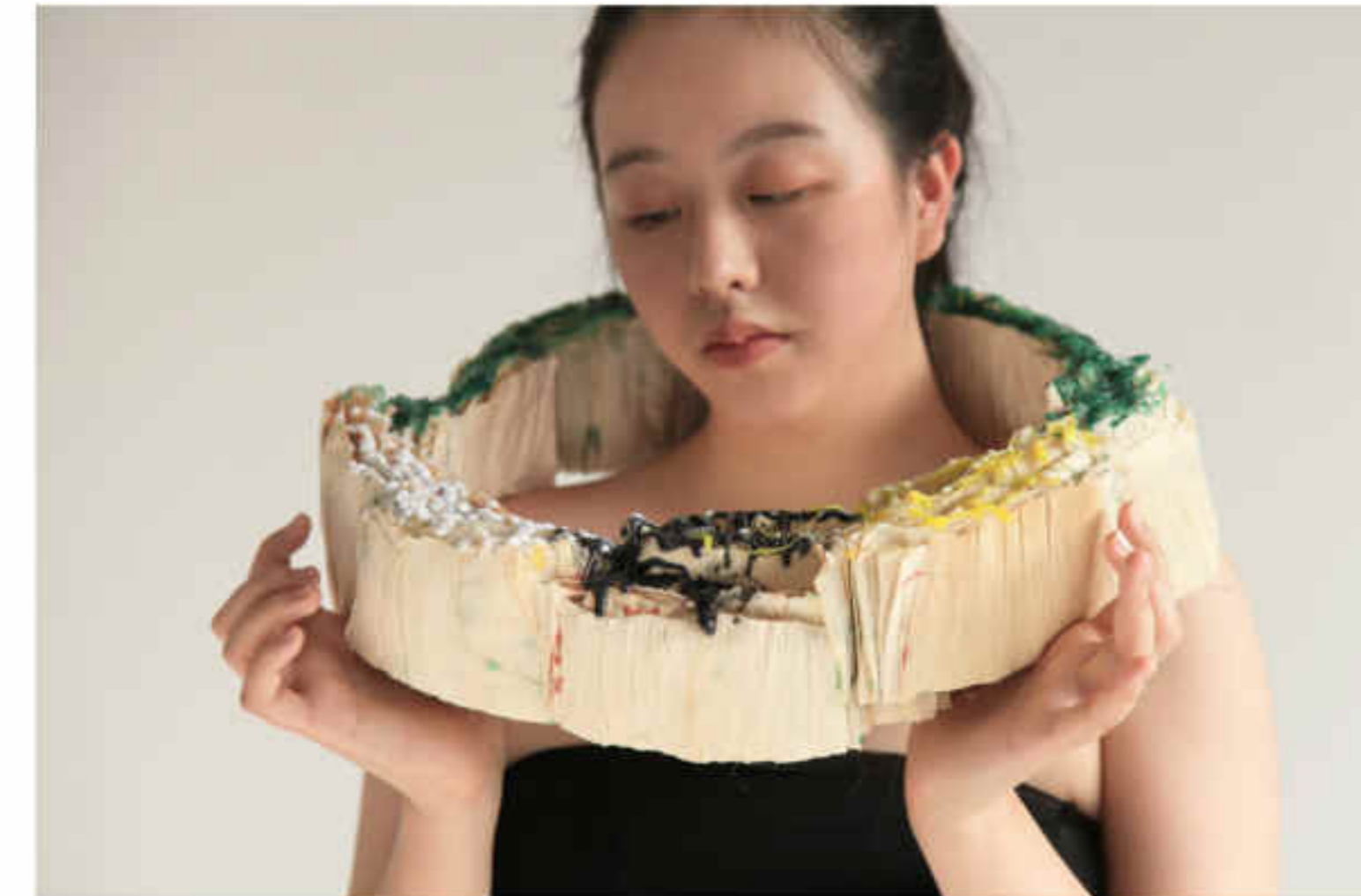
Necklace / corn leaves / coloured glue stick / 50*50cm