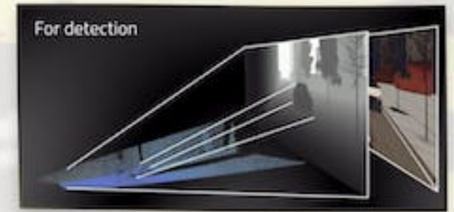
ToF (Time of Flight Sensor)