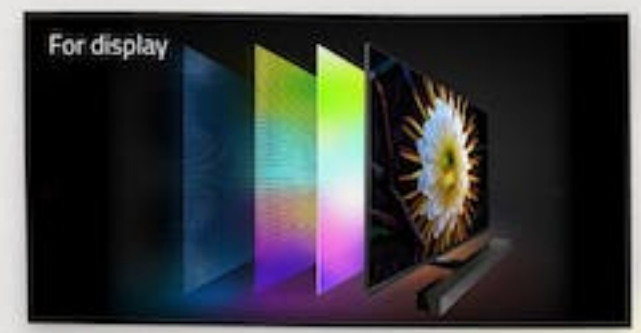
Transparent OLED Screen